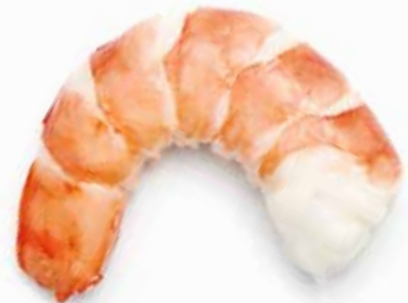
Cooked Peeled and Deveined CPD