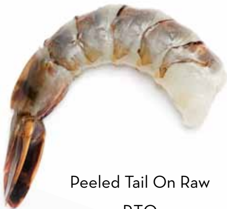
Peeled Tail On Raw PTO