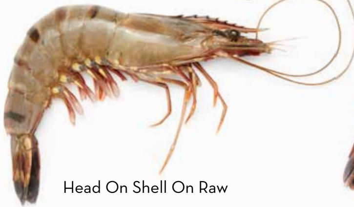
Head On Shell On Raw HOSO

Firm Texture Exquisite Taste Vibrant Color