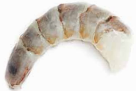
Peeled and Deveined Raw PD