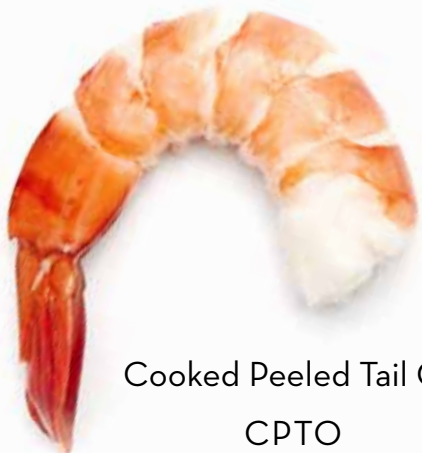
Cooked Peeled Tail On CPTO