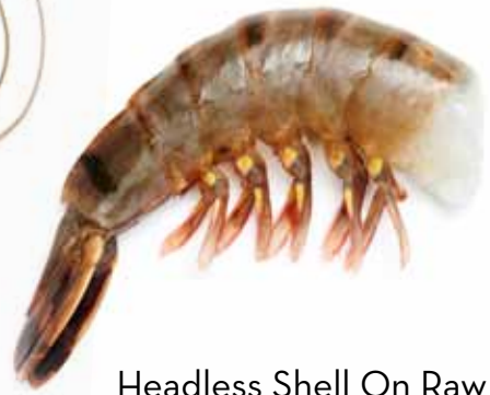
Headless Shell On Raw HLSO